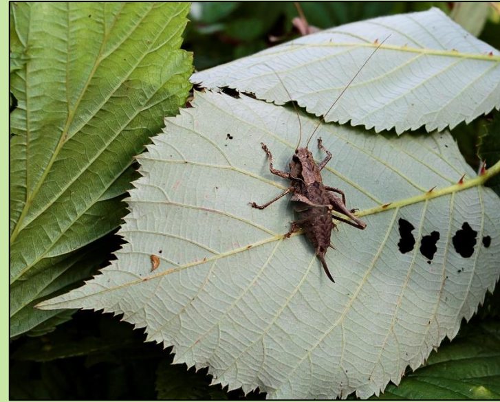
Dark Bush cricket.