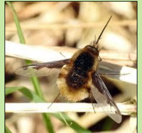
Dark-edge bee fly.

Other wildlife sightings at the wetland.